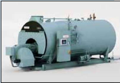
Get the best efficiency from your boiler by understanding stack temperature. (CBEX Premium Boiler pictured above)